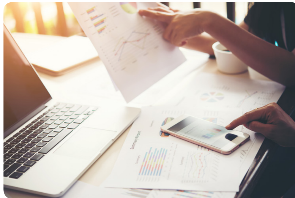
**Figure 3: Students working

Students found that infographics helped them to convey the core information of their research projects to the rest of the class and contributed to their understanding of the visual representations required when presenting projects. They struggled with the graphics but the software that was used made it easier. The main challenge was condensing a lot of qualitative data for the infographics.