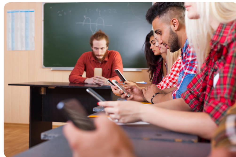
**Figure 1: Learning technologies can provide immediate feedback to students

Various technological resources provide the means to offer immediate feedback to students on their performance. They also create a bridge between the traditional setting of the classroom and the ever-increasing digital and technological world in which students are immersed (Oomen-Early & Early, 2015). Furthermore, game-based learning and gamification of learning have proved to be effective tools to enhance student engagement. This, in turn, can support the development of problem solving and critical thinking skills. Games have also been used to review class content effectively (Dellos, 2015).