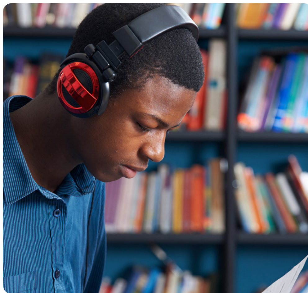
**Figure 1: Learning technologies allow more possibilities

For the lecturers, using the peer video assessment workshop changed their role to that of moderator rather than examiner. Moderation was done online and within a set time period.