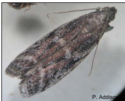
Carob moth, Ectomyelois ceratoniae , male adult.

Adults are small, inconspicuous grayish moths which vary in terms of their size, wing markings and genital structures. The rear wing is light gray and fringed with long hairs.