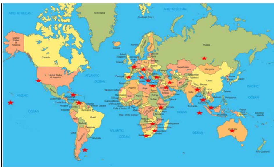
Carob moth, Ectomyelois ceratoniae , distribution. Red stars indicate published presence records of pest. Base map from http://geology.com/world/world-map.shtml . Reprinted from Morland (2015).

Carob moth is thought to originate from the Mediterranean region but is found all over the world. In South Africa it was first discovered in the Western Cape in 1974 but has since been found throughout South Africa.