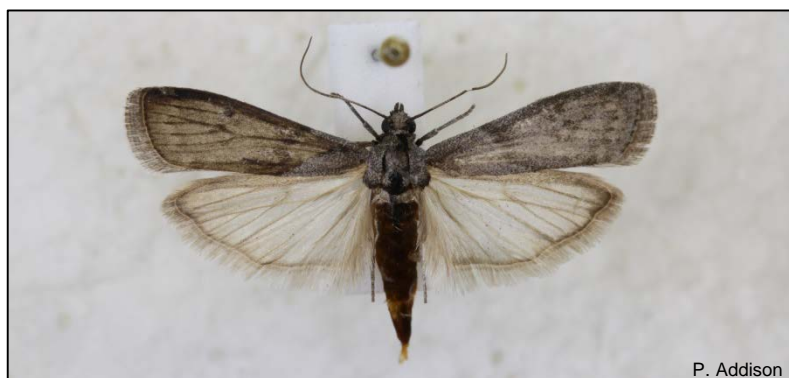
Carob moth, Ectomyelois ceratoniae , adult.

The pest is thought to have 4 or 5 generations per year under good conditions. Larvae overwinter inside available citrus or other fruit. Orchard sanitation (removal of rotting or fallen fruit) seems to be important for maintaining low carob moth populations. Their numbers are elevated in orchards with severe mealybug or other honeydew-producing insect infestation, sooty mould or fungal growth. Two commercial lures are available in South Africa and chemical controls for FCM should be effective against carob moth as well.