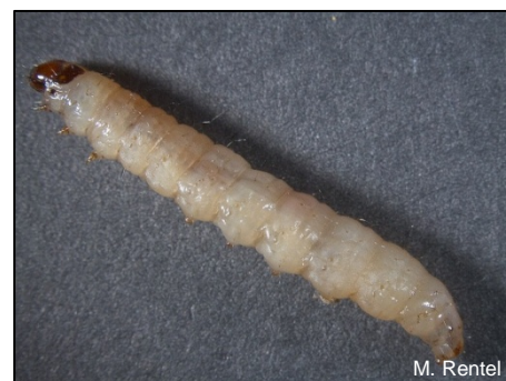
Carob moth, Ectomyelois ceratoniae larva.

Larvae are slender, elongate, cream white to light pink in colour. Their head capsules are yellow to brown and superficially they look similar to FCM larvae.