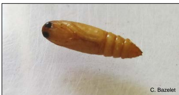
Carob moth, Ectomyelois ceratoniae , pupa.