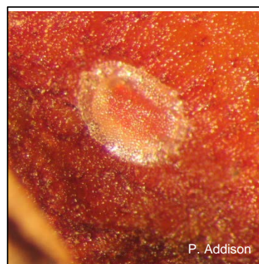
Carob moth, Ectomyelois ceratoniae , egg.

Eggs of the carob moth are usually ovoid in shape and deposited singly or in clusters of up to 3 eggs. Eggs are first whitish/yellowish but turn pink 12-24 hours after being fertilized. Below 20° C, eggs do not hatch.