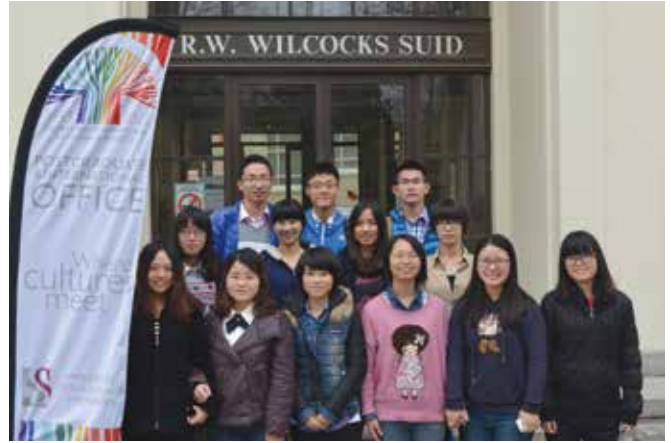
Stellenbosch University recently welcomed its first group of semester-exchange students from the People's Republic of China. Thirteen students from Zhejiang Normal University's China-Africa International Business School (CAIBS) will get the opportunity to learn more about the local academic culture and student life. The exchange programme is aimed at strengthening the relationship between SU and universities in China, and will lead to Stellenbosch students undertaking semester exchanges at CAIBS in future.