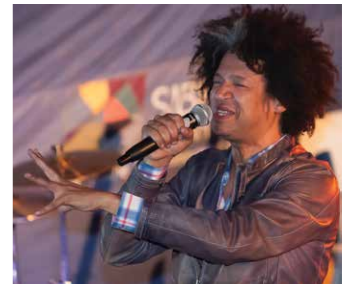
COMEDIANS PLAY RACE CARD: Two of South Africa's funniest men had SU students and staff in the palm of their hands during Diversity Week. Marc Lottering (pictured above) and Siv Ngesi drew full houses when they performed in the tent on the Rooiplein on respectively Wednesday, 2 October and Thursday, 3 October. Both made jokes about the diverse people of South Africa. Lottering joked about learner drivers, snobbish sales people in expensive boutiques and hair culture. Ngesi poked fun at the way black, coloured and white people act when they get out of the water, hair (yes, he too) and the way different cultures dance.

Watch a video of the Diversity Week celebrations on YouTube at http://youtu.be/XKojrFqELtw