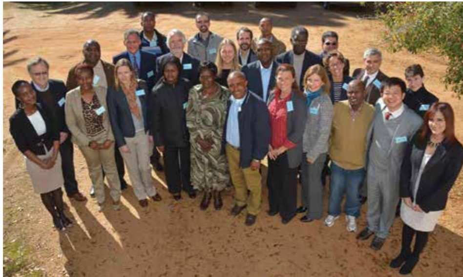
Delegates attending the launch of RADAR and the first day of the United Nations STiR Meeting, hosted at STIAS on 11 September.