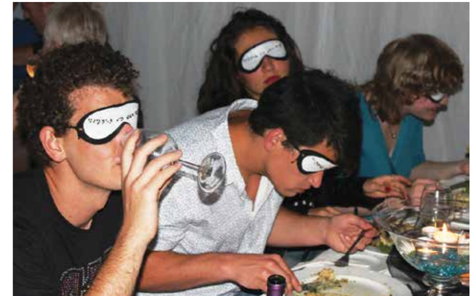
Dis-Maties se gaste by die Dinner in the Dark-ete het die uitdaging aangegryp om minstens hul hoofmaal geblinddoek te eet.

voorgesit, maar die kinkel in die kabel was dat gaste minstens die hoofgereg geblinddoek moes eet. Sommige het so ver gegaan as om al drie gange met die blinddoek aan te eet en dit het tot 'n paar interessante ervarings gelei.