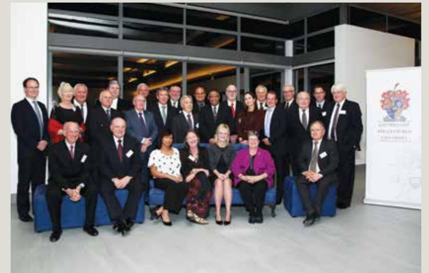
The group of donors who received Vice-Chancellor's Awards from Stellenbosch University at a function held at the Cavalli Wine and Stud Farm in Stellenbosch.