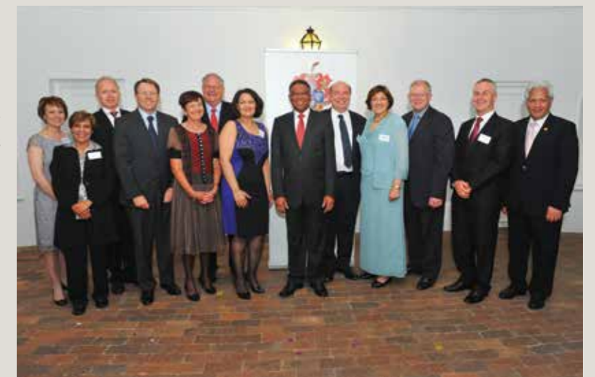
Stellenbosch University honoured these donors with Vice-Chancellor's Awards at a function held at The Courthouse in Sandhurst, Johannesburg.

SU. The academic excellence of a university is of utmost importance, as well as the preparation of the students for their future role in the workplace and community. In my life SU has played a particularly important role in this regard."