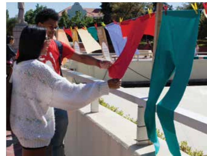
DIRTY LAUNDRY: Maties could publicly air their dirty laundry on the Rooiplein. Washing lines with paper "clothing" were erected on which Maties could write their experiences of discrimination.

Quite honestly, I do not think we really know who this group of people is or what their frame of reference is. They experienced a whole new world from the day they were born, right through the new schooling system to a changed university landscape. It is important to get to know them and to understand what makes them tick. We are lucky that we have some of the best born-free minds in the country at Maties. We are proud that we are not just a knowledge provider, but that we also equip our students to flourish in the diverse context of our country and continent.