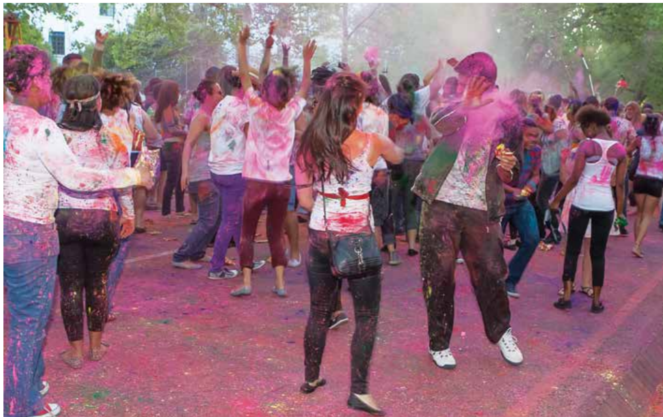
The University's week-long diversity celebrations came to an end on Friday, 4 October with the first-ever Festival of Colours held in Stellenbosch. Hundreds of Maties descended on Victoria Street to participate in this festival. Popular band Draadkar and MFM DJs were responsible for the festive atmosphere while students, lecturers and even a few children threw coloured powder at each other.