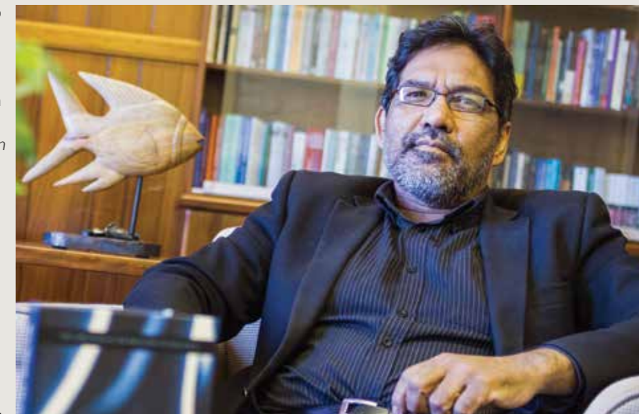
Prof Yusef Waghid

In addition, a special issue of the academic journal Studies in Philosophy and Education related to Islamic education and the challenges and opportunities in a postmodern world is due to be released in January. This edition of the journal will also be published as a monograph.