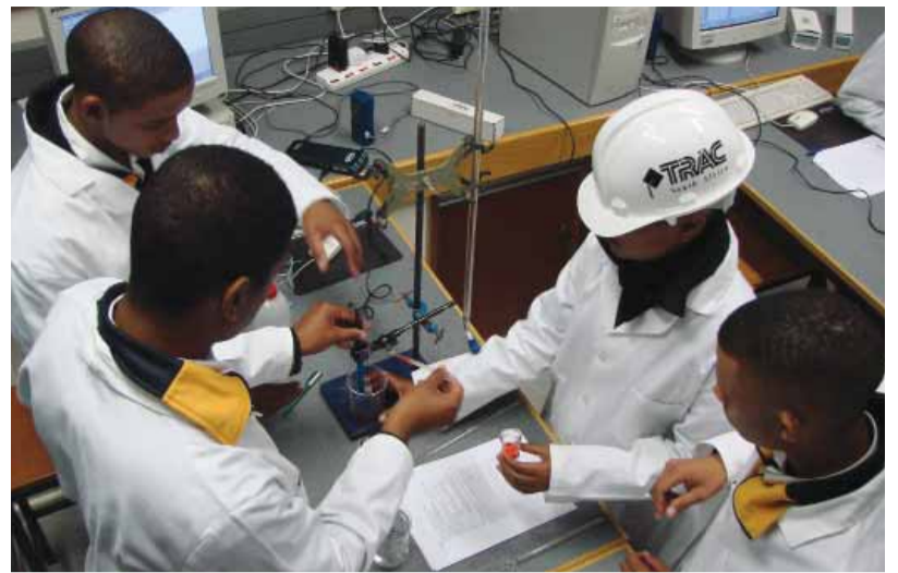
High school learners gain hands-on Chemistry experience in a TRAC mobile lab.