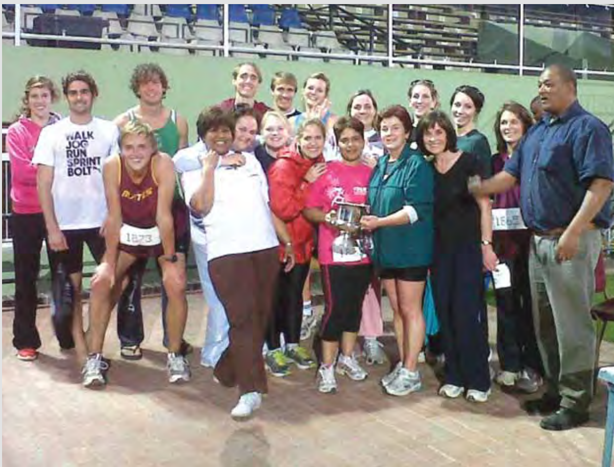
Dié span ywerige stappers oefen drie keer per week by Coetzenburg om fiks en gesond te bly.

Fikser, gesonder en gelukkiger personeellede is wat die US se Welwees-kantoor in die vooruitsig stel vir 2012.