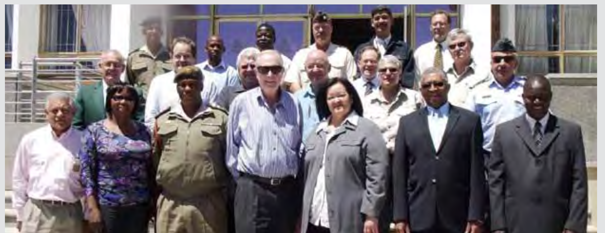
SU council members, joined by the Rector's management team, visited the Military Academy in Saldanha.