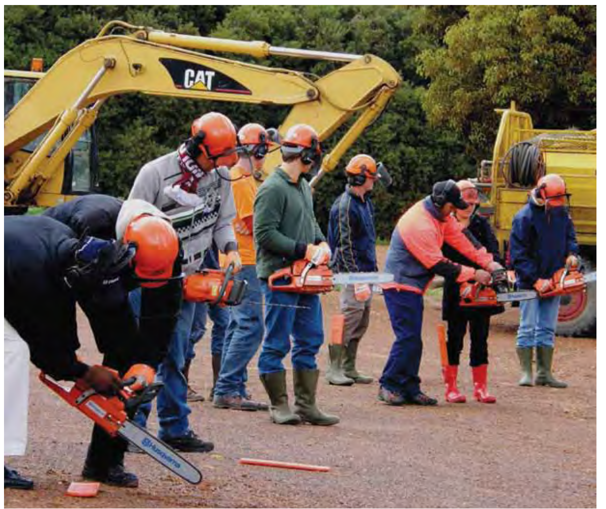
Some of the BSc Forestry students hard at work during the chainsaw appreciation course, presented by SU’s Department of Forest and Wood Science.